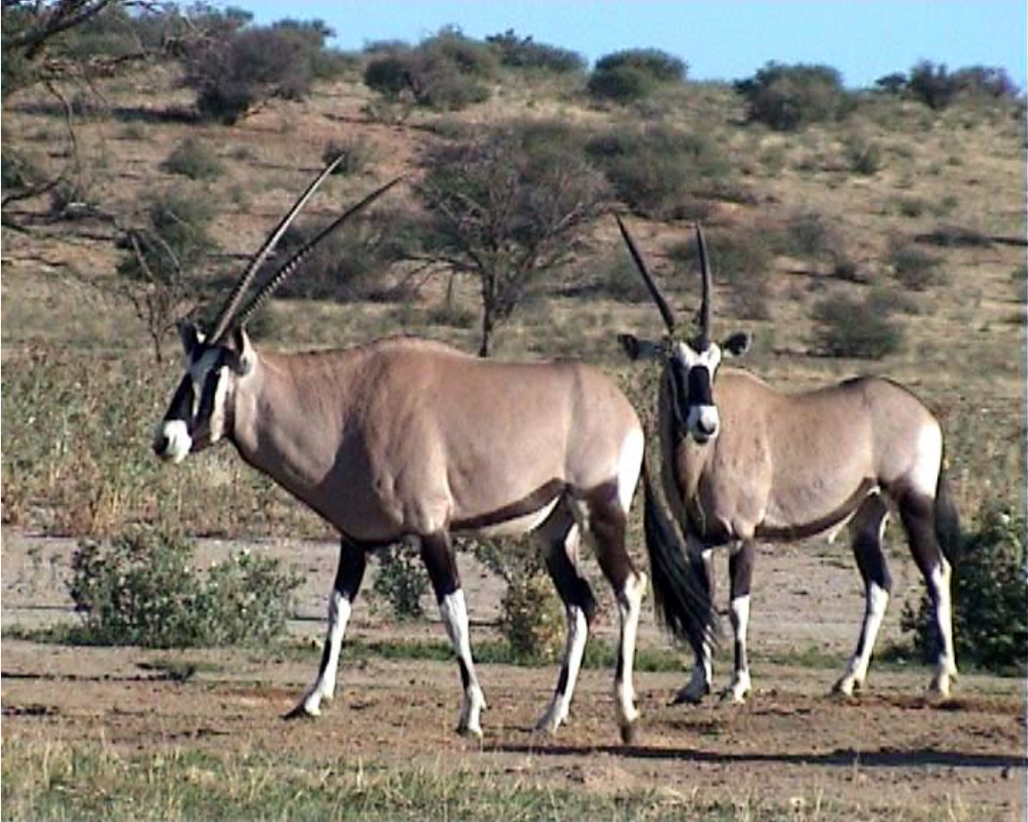
Overgrazing is not only a problem of domestic animals. Game can damage the veld as well when kept in too large numbers.

There are different models of vegetation dynamics in the Karoo, none of which seems totally realistic to me. What most of the models basically say is that some of the changes or damages to the veld are easily reversible, while others need more than just rest, if a good veld state should be restored. The five main parameters in any grazing system, which should be varied according to the circumstances, are: Stocking density , which affects grazing intensity, trampling and hoof action. Grazing period , the amount of time the animals spend in one camp. Rest period , the crucial point in any system. Herd composition , which