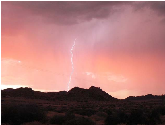
The first thunderstorm of the year.