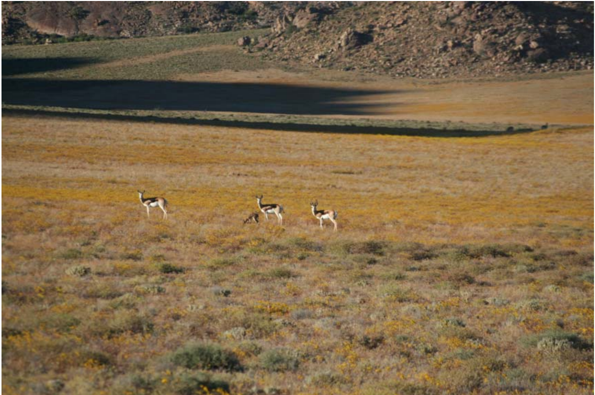
Overgrazed veld has a lot of wildflowers in spring, but no vegetation at all during the rest of the year. The area in the picture is plain sand in summer.

Switzerland). However, disturbance caused by humans can occur even in the absence of widespread human settlements, and this is the case here: Due to overgrazing, up to two thirds of the land used for grazing has been severely degraded. Overharvesting of the flora for the international trade in ornamental plants, and other economically important activities such as small and large-scale mining and agriculture along river corridors create additional problems: Pollution and land destruction, excessive diversion of water from rivers, probably also salinized soils.