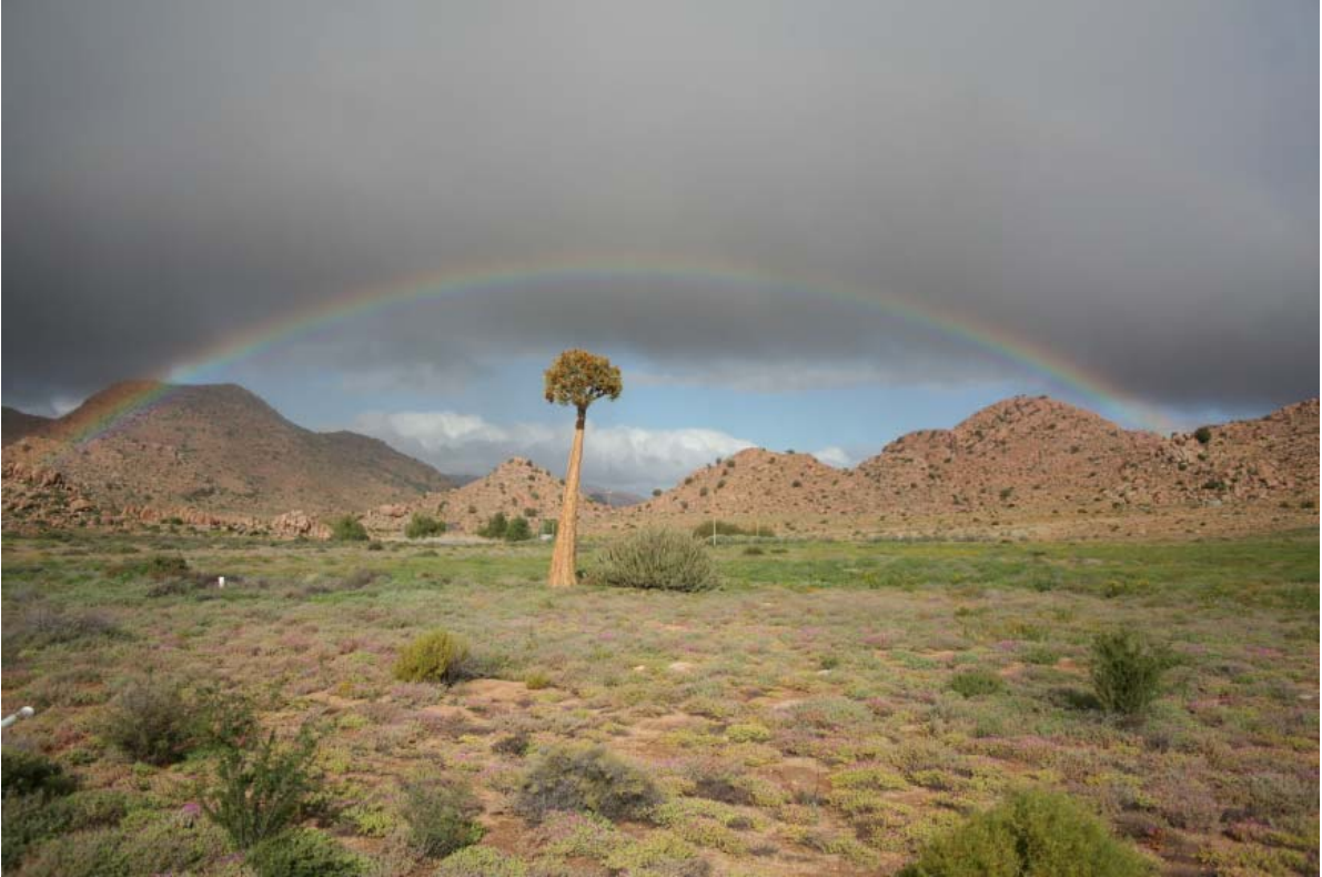
Natural vegetation in Goegap Nature Reserve, after the ones overgrazed veld (formerly it was a farm) could rest for 10 years (C. Schradin).

Just looking at the latitude, one might think that the area should be a kind of savannah. However, the Succulent Karoo biome is primarily determined by low winter rainfall and extreme summer aridity. Because most grasses need rain in warm weather (which means in summer) for rapid growth, they are largely absent from the Succulent Karoo. Instead, the dominating plants are dwarf succulent shrubs. Yet even succulents, which make up 29 percent of all plant species in Namaqualand and are well adapted to its climate, need a certain amount of water to grow and reproduce. The average vegetation cover of perennial plants is therefore low and ranges between 15 and 20 percent. In spring, after the winter rainfalls, the picture is completely different.