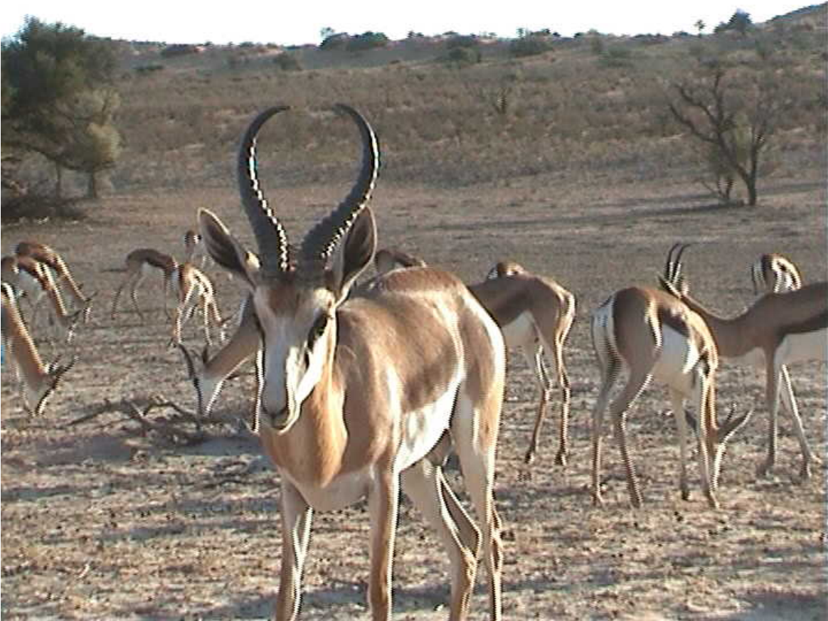
Springbok are often kept on game farms.

In the Karoo as a whole (comprising the Succulent Karoo in the west and other types of Karoo in the east), there are currently two major land use trends. First, many economically nonviable small farms, which have been over-exploited in the past and are now not producing enough income to support its owners, are being consolidated to form large farming units for game ranching and ecotourism. These forms of land use are entirely based on the “natural capital” of the Karoo. Thus, much money has to be invested into restoration of wilderness and upgrading of destroyed habitats. For conservationists this is certainly