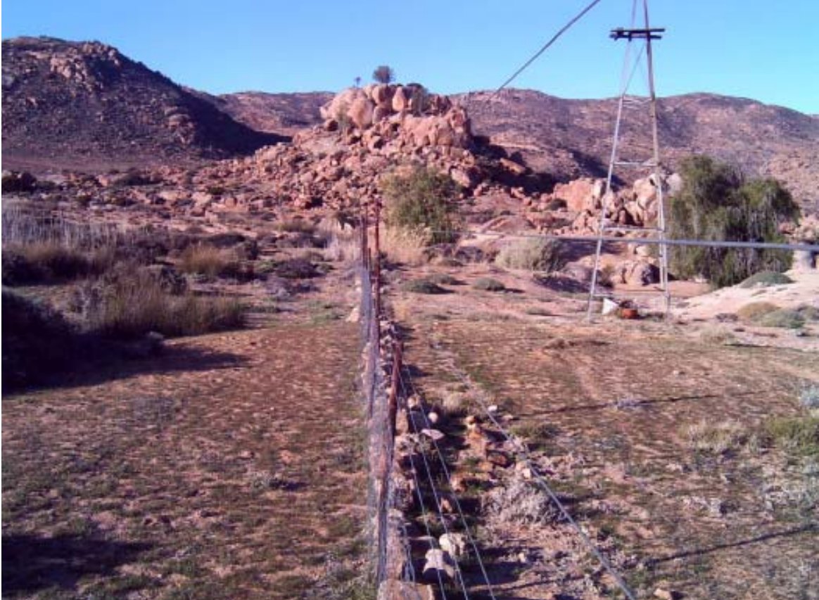
Fence in Namaqualand, left the Goegap Nature Reserve, right an overgrazed farm.

The Succulent Karoo is one of 25 global biodiversity hotspots: an area that is exceedingly rich in endemic species and particularly threatened by human activities. Given such international significance, I became even more interested in finding out how this region should be managed in order to ensure the long-term maintenance of its biodiversity, while promoting sustainable development for its human inhabitants. In fact, I believe that these two aims cannot be separated. National parks and nature reserves like Goegap, which conserve part of an ecosystem in a more or less pristine state, are undoubtedly very important. However, if they are only islands surrounded by degraded or