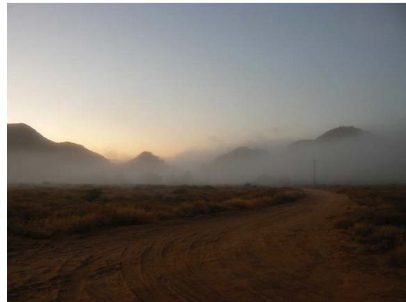
A misty winter morning.