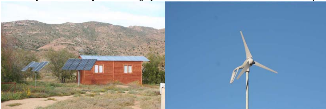
Solar system and wind turbine at the research station.

Power for light and computers is provided by a solar system and a wind turbine. Each room has one power plug. However, power is restricted and you are not allowed to use any devices that use a lot of power like a hair dryer. However, you can charge your camcorder, camera, toothbrush or cell phone.